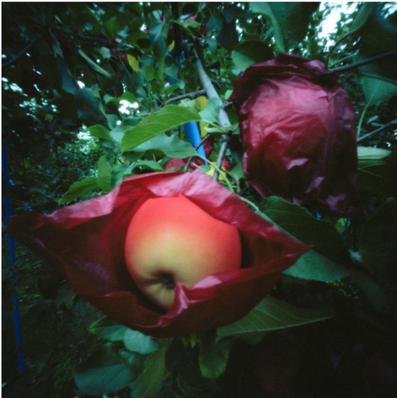
Apples With Red Inner Bags #2, Fall, Aomori Prefecture