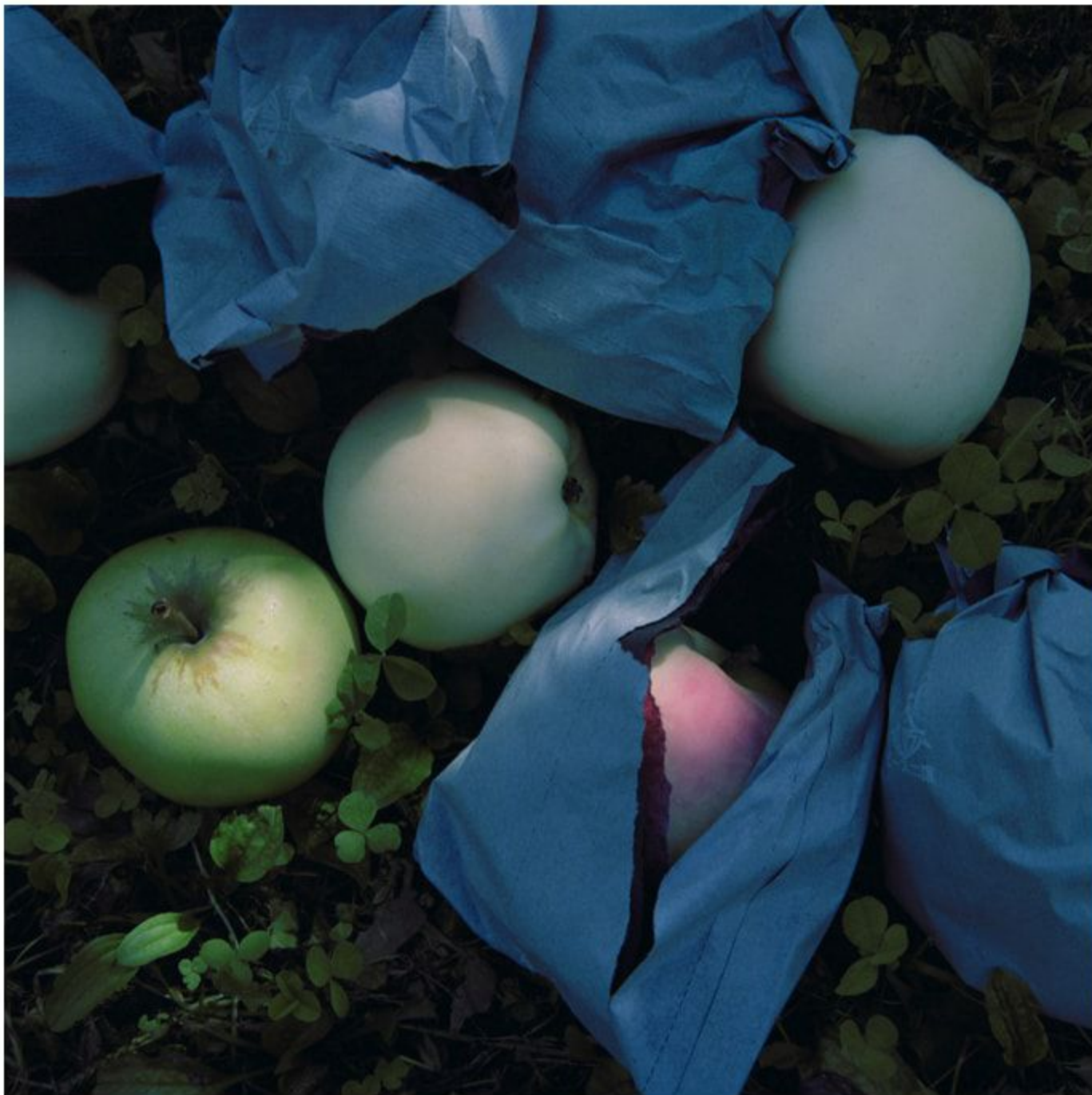
Culled Apples, Fall, Aomori Prefecture