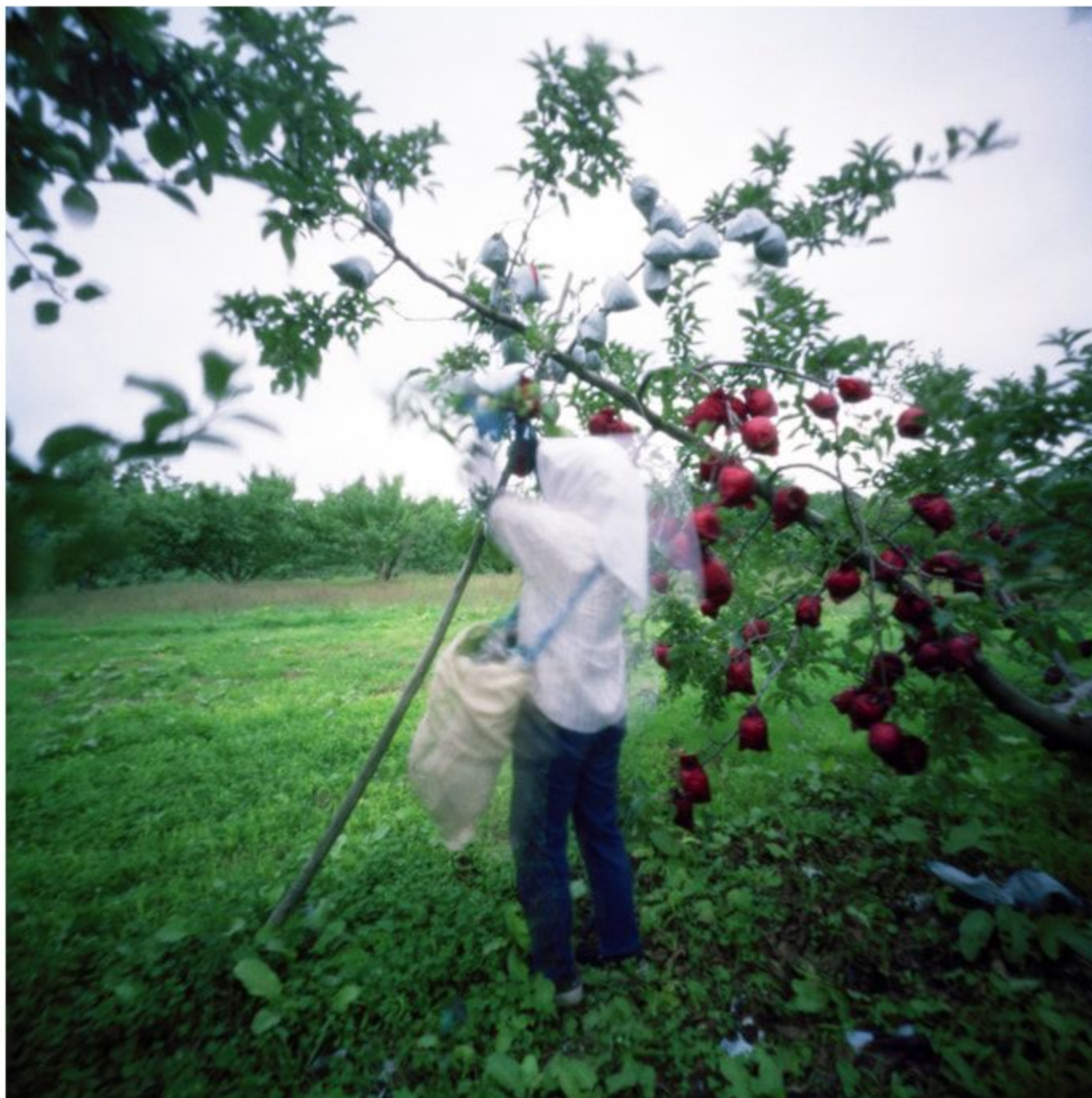
Removing Outer Bags #1, Fall, Aomori Prefecture