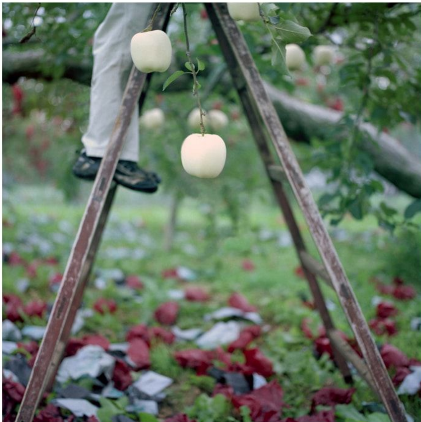
After Inner Bag Removal, Fall, Aomori Prefecture