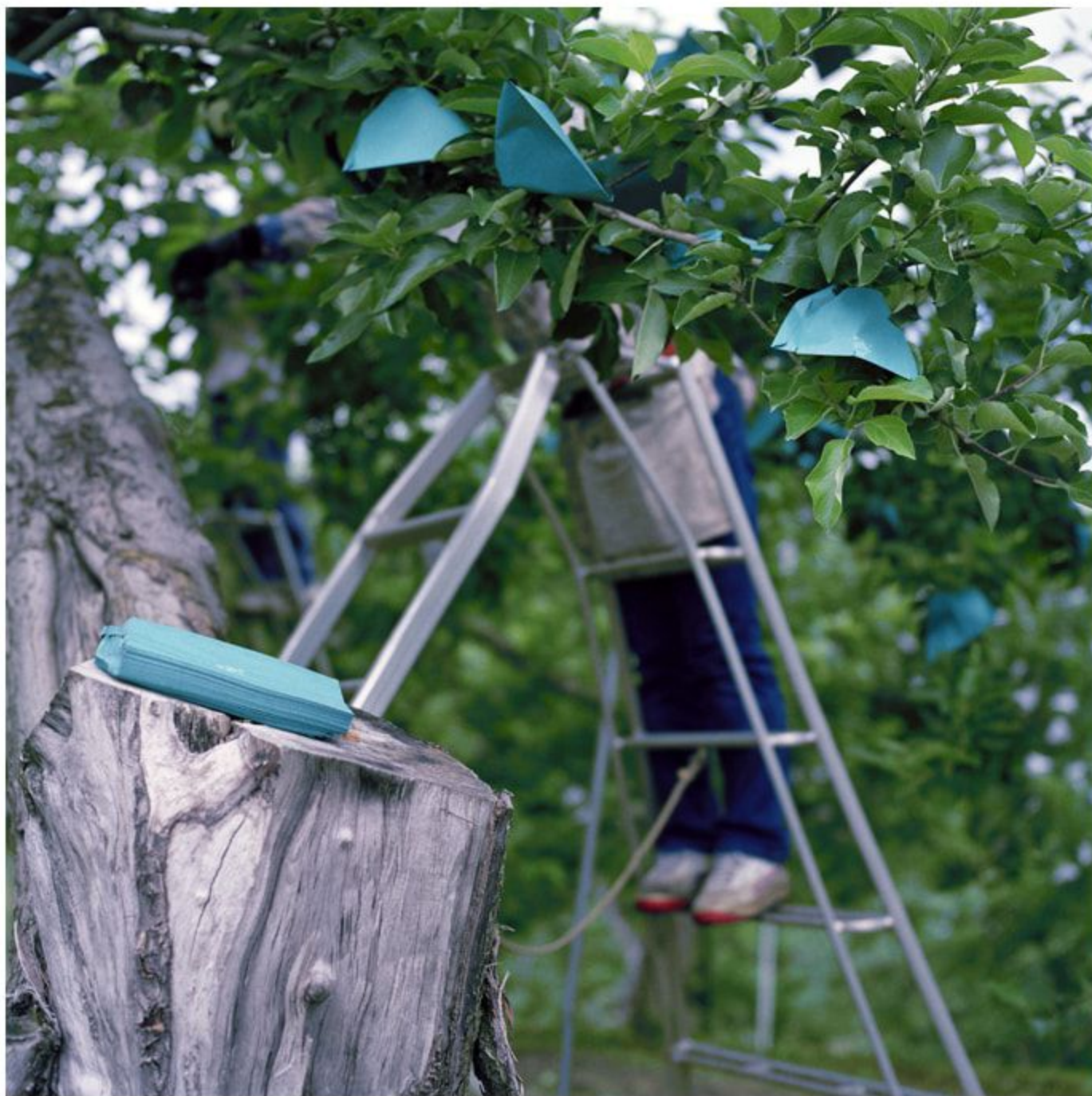
Bags for Apples, Early Summer, Aomori Prefecture