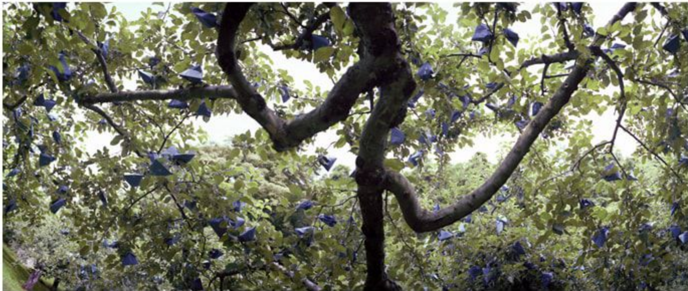
Bagged Apple Tree, Early Summer, Aomori Prefecture