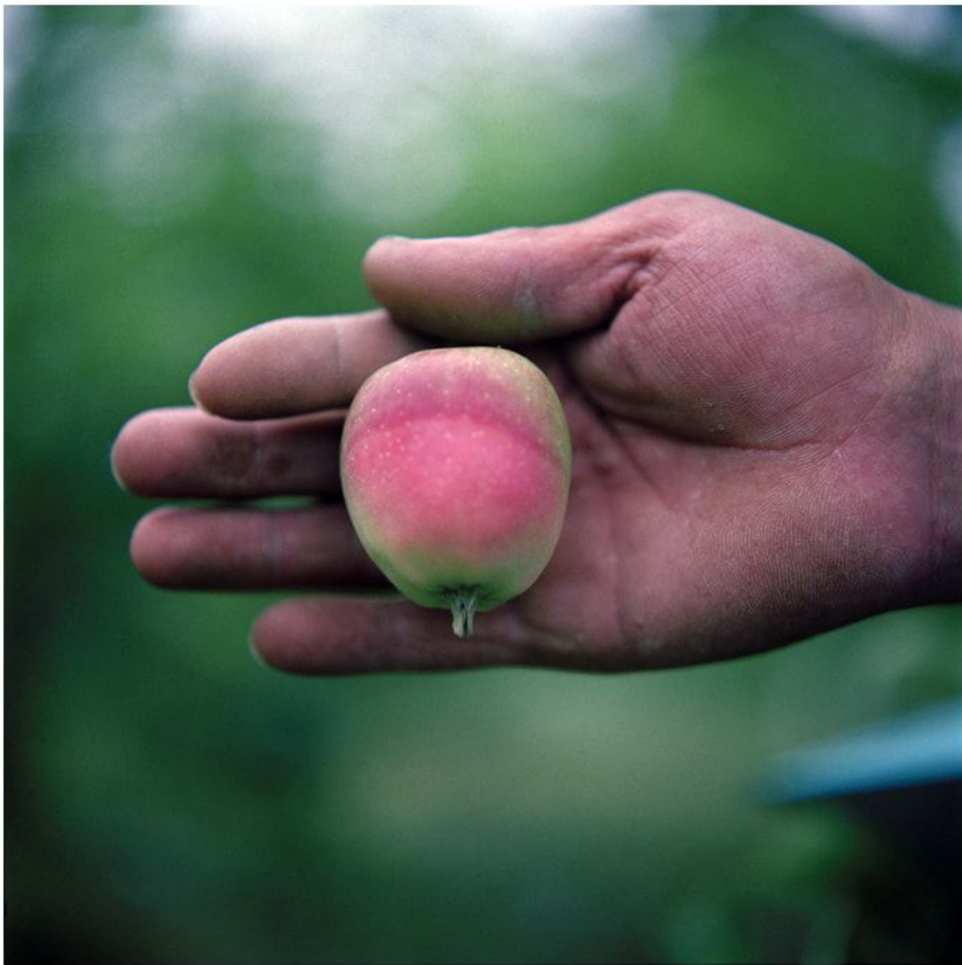
Imperfect Apple, Summer, Aomori Prefecture