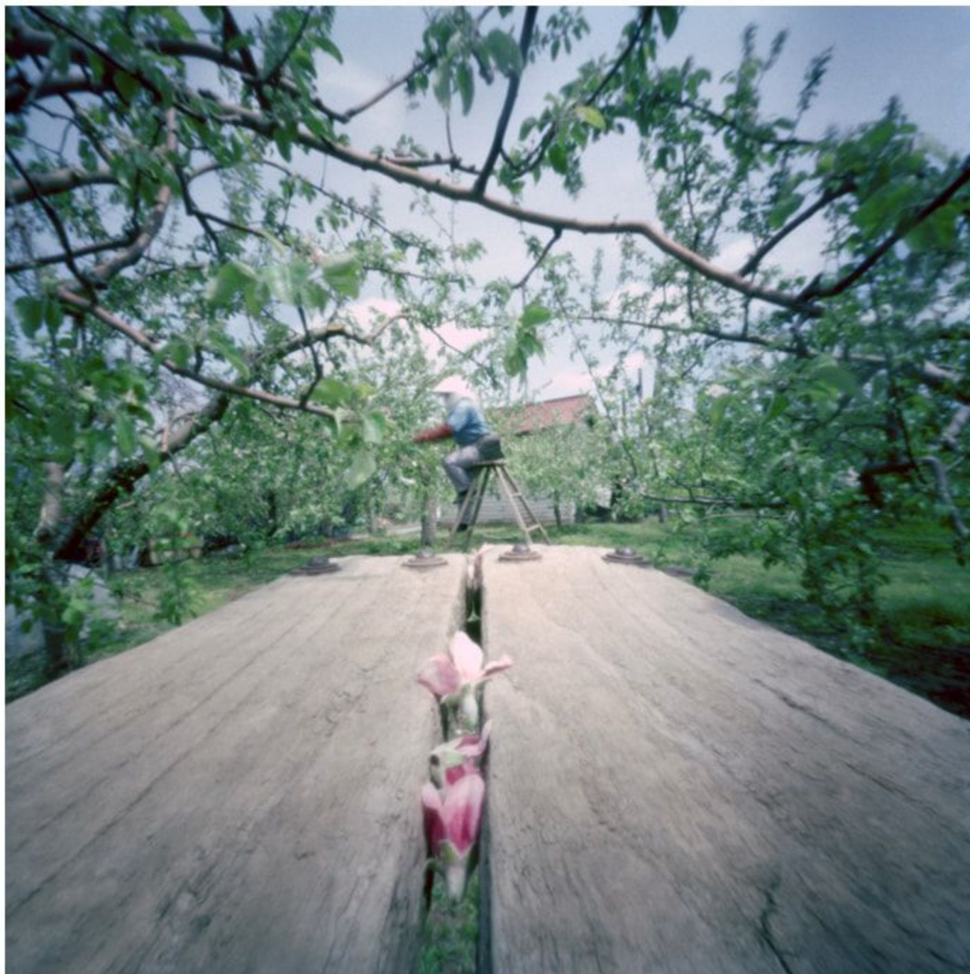
Culling Blossoms #2, Spring, Aomori Prefecture