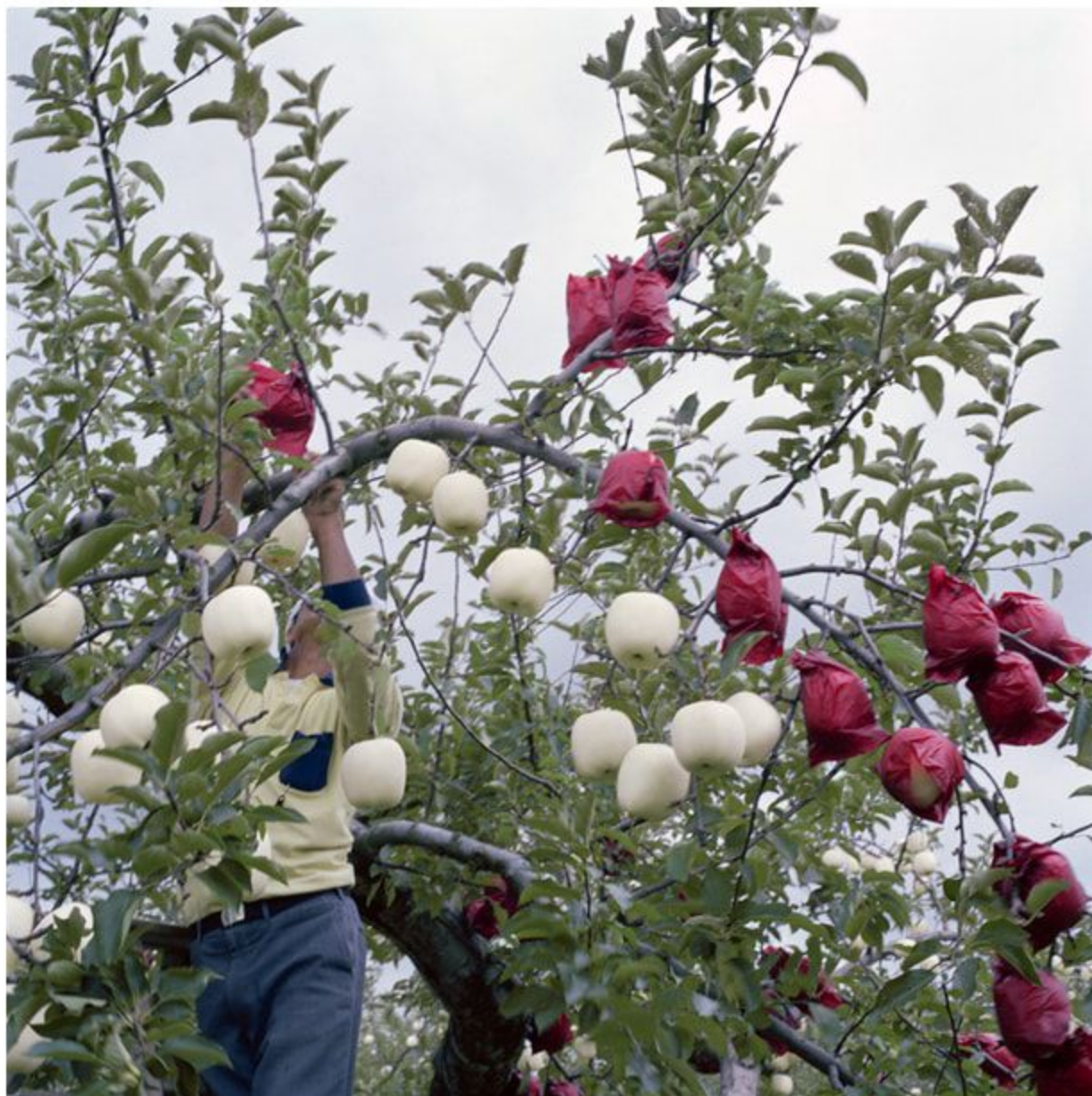
Removing Inner Bags #1, Fall, Aomori Prefecture