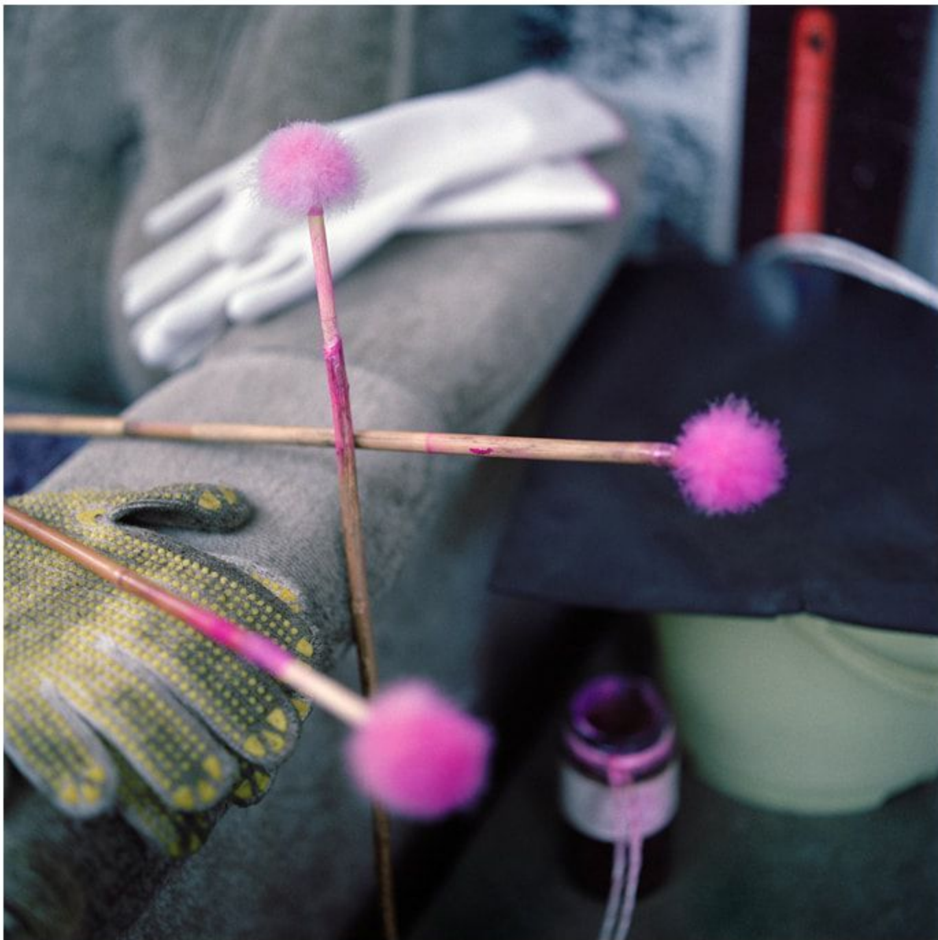
Pollination Wands, Spring, Aomori Prefecture