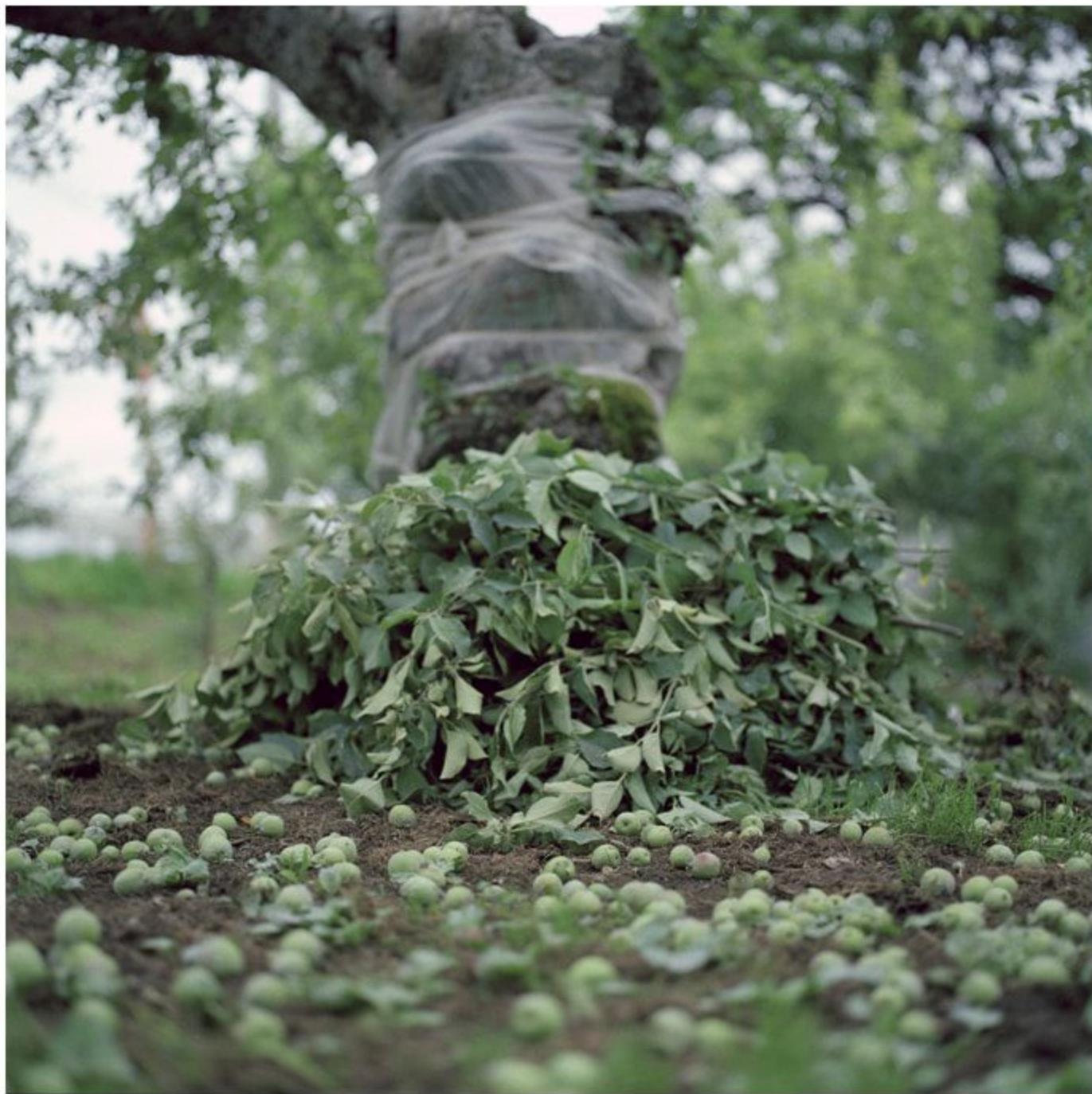
Culled Apples & Branches, Early Summer, Aomori Prefecture