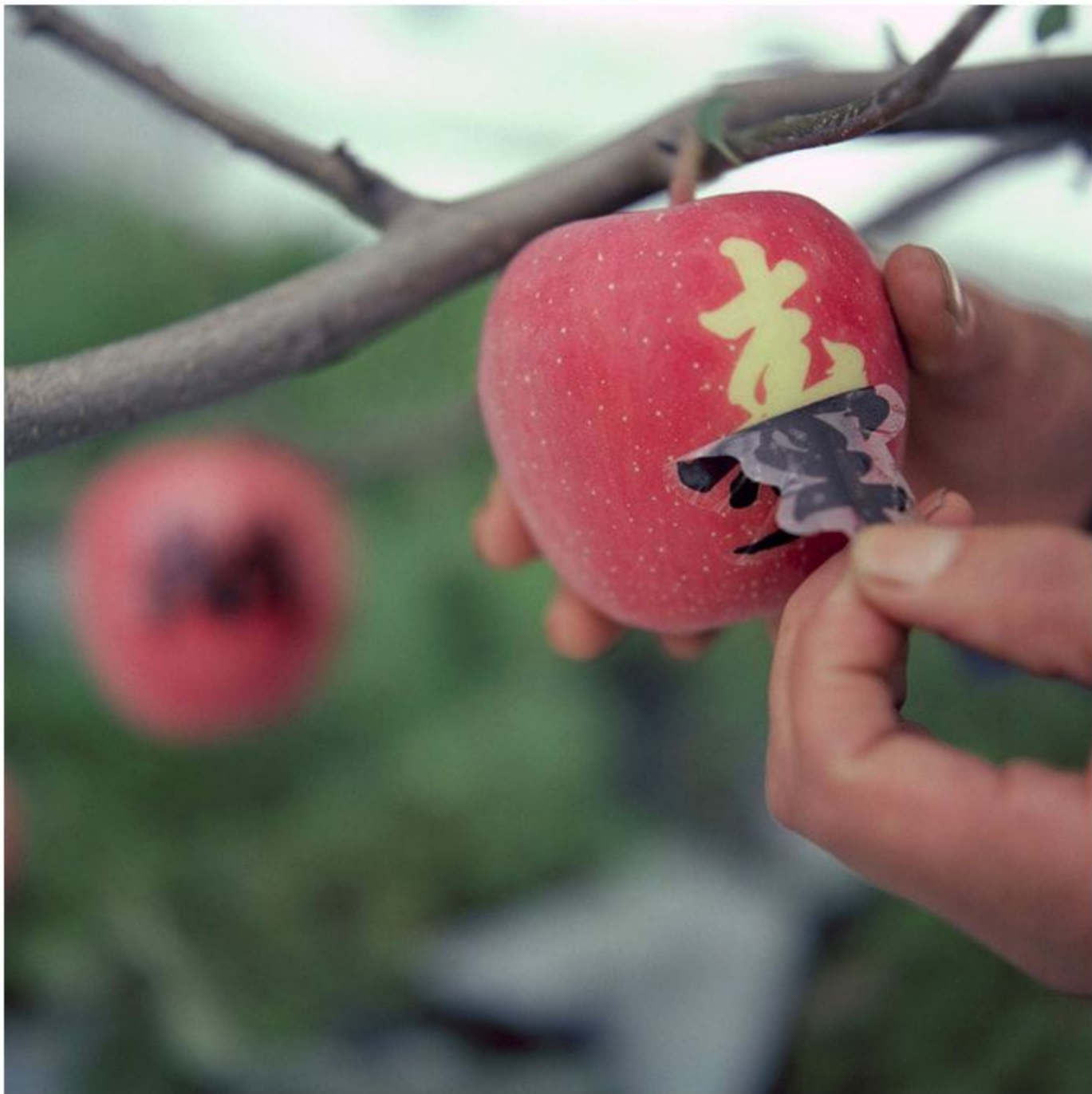
Photogram Beneath the Stencil, Fall, Aomori Prefecture