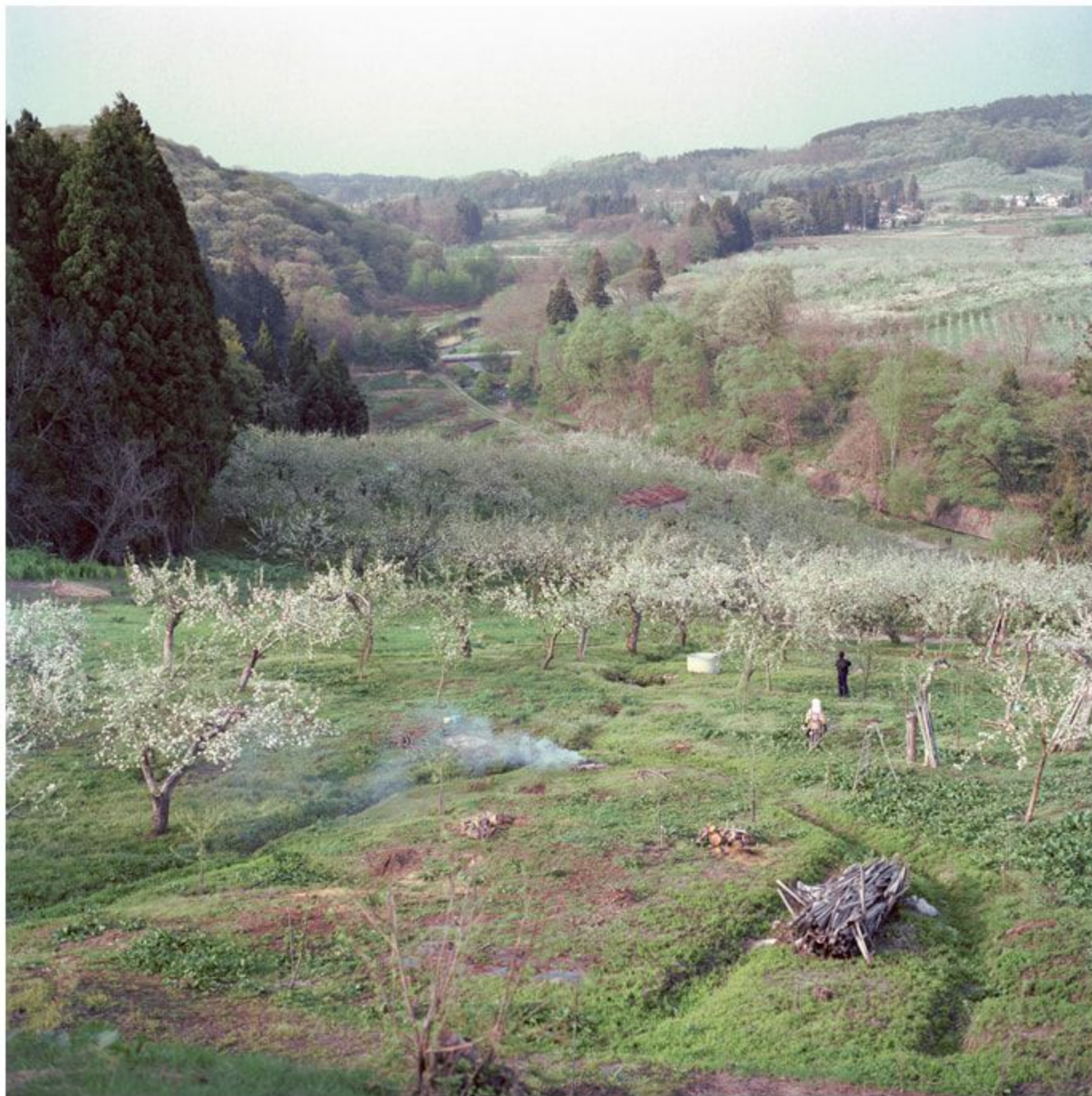
Burning Trimmed Branches, Spring, Aomori Prefecture