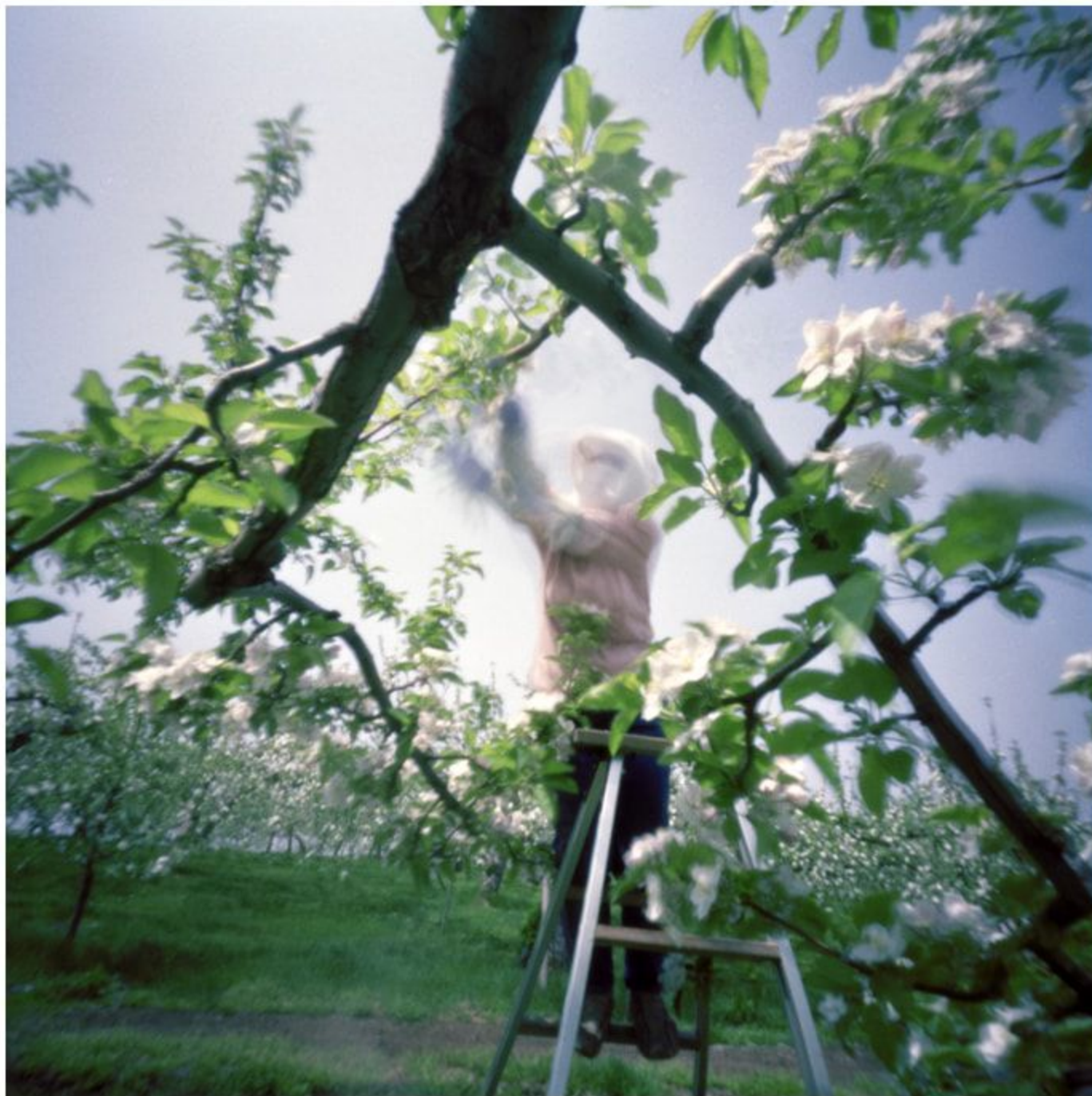
Culling Blossoms #3, Spring, Aomori Prefecture