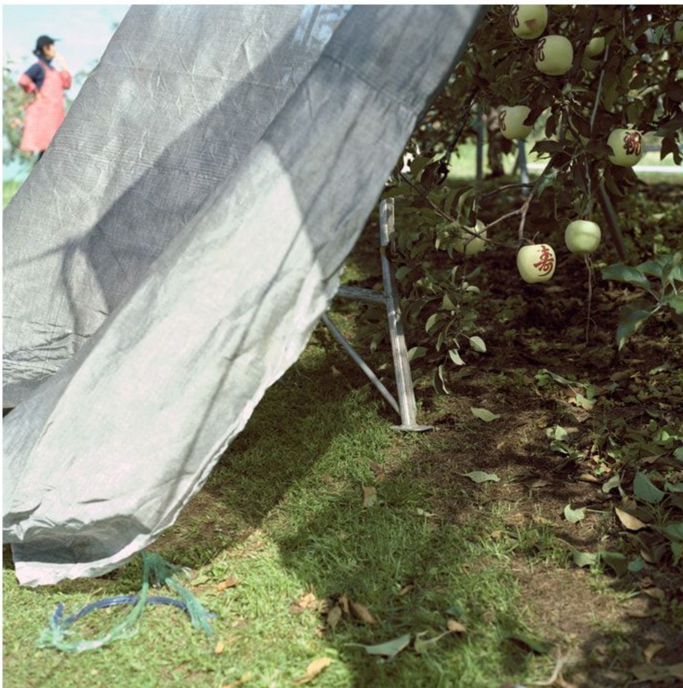
Field Worker & Stenciled Apples, Fall, Aomori Prefecture