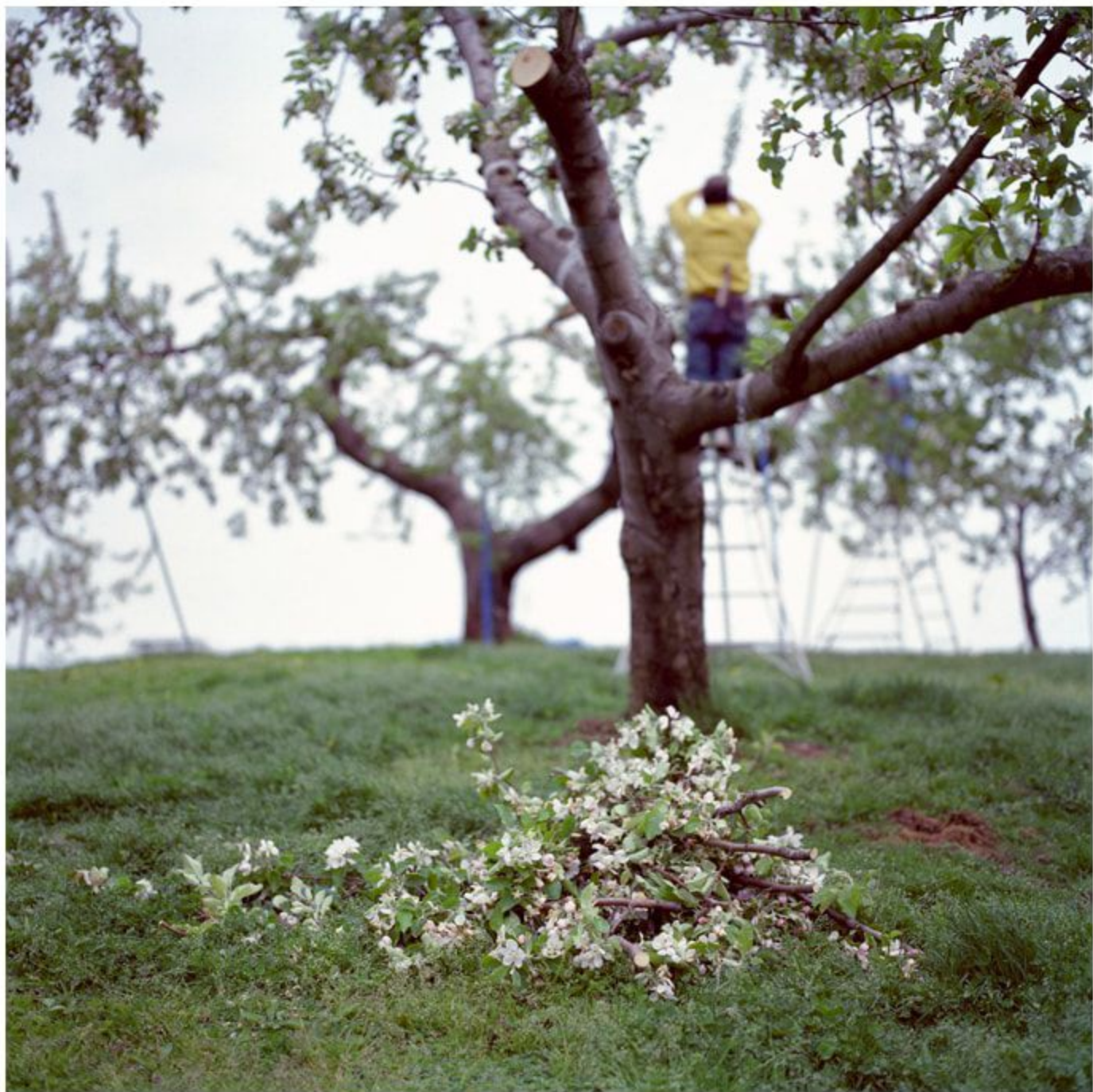
Culling Blossoms #1, Spring, Aomori Prefecture