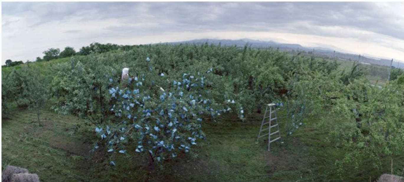
Putting Bags on Apples #1, Early Summer, Aomori Prefecture