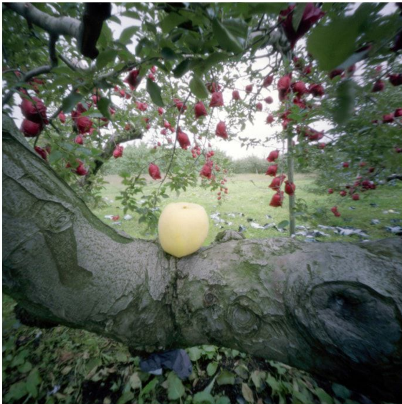
Rejected Apple, Fall, Aomori Prefecture