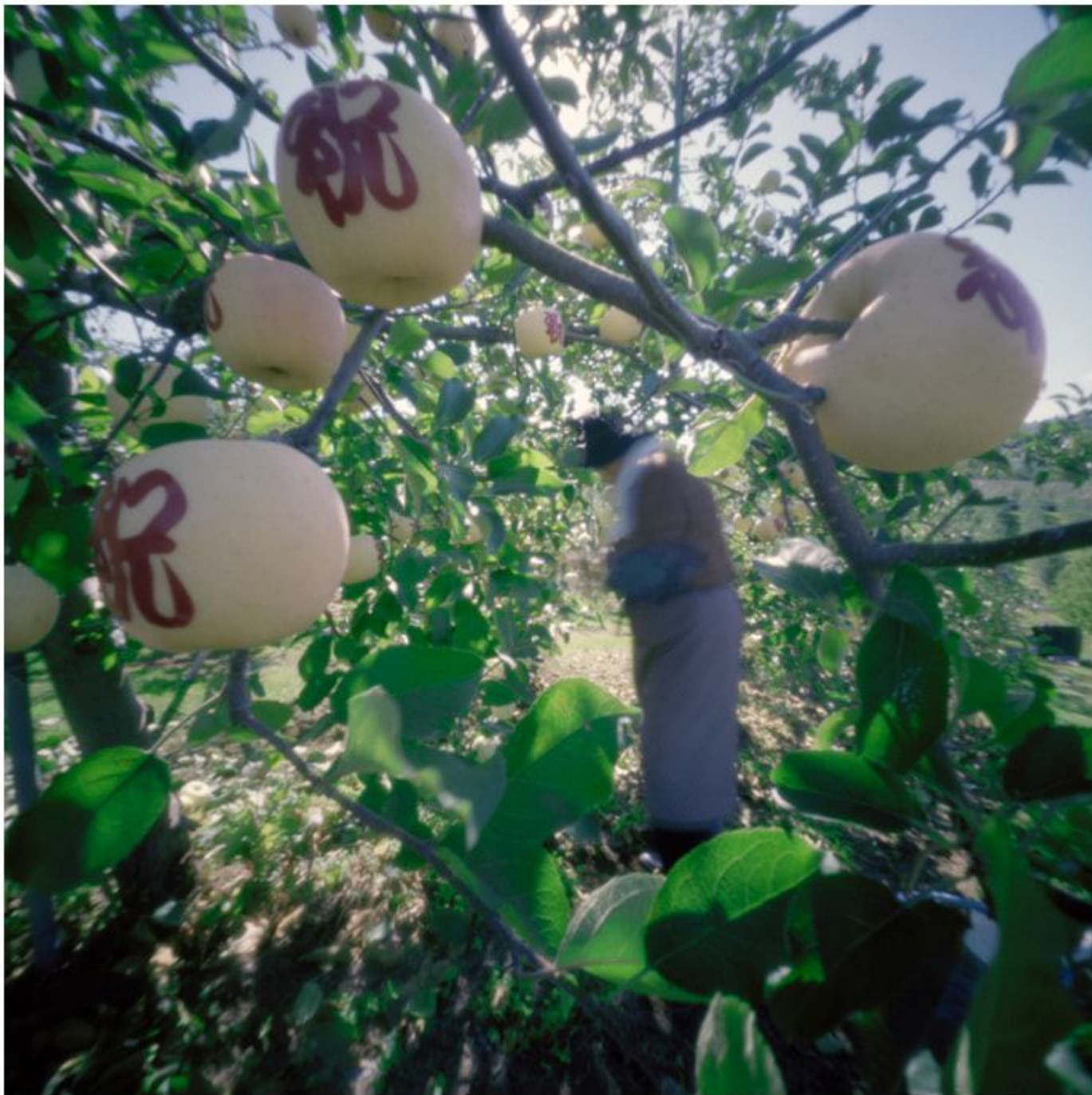
Stencils Being Applied to Apples, Fall, Aomori Prefecture