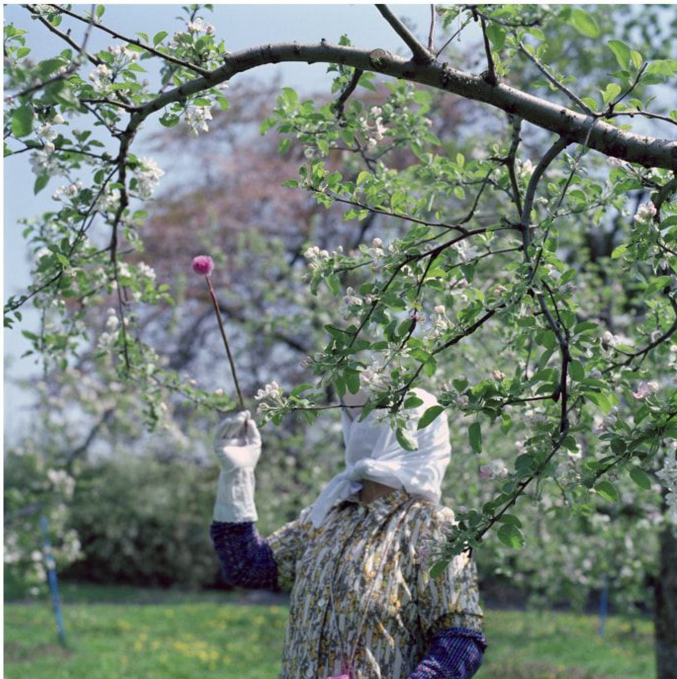
Hand Pollination #1 - Spring, Aomori Prefecture