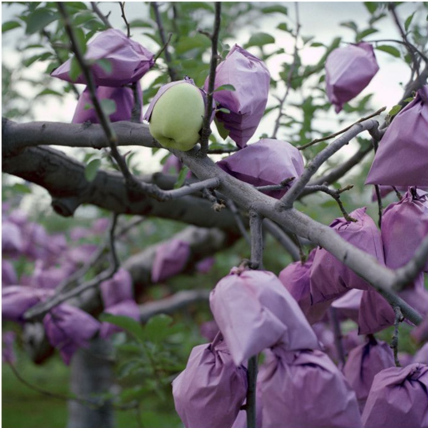
Apples Outgrowing Their Bags, Fall, Aomori Prefecture